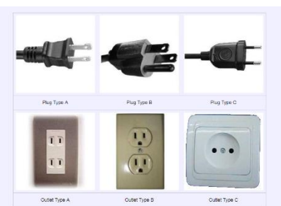
Most Commonly Used Plugs & Outlets in Peru

Most U.S. carriers, Verizon, AT&T, etc., will allow you to use your cellphone to make calls to the US from Peru. However, unless you have purchased an international plan, you will rack up a huge bill before you know it. So the best way around this is to leave your phone on airplane mode once you arrive in Peru. And if you need to call someone in the US we will assist you in doing so in the most affordable manner.